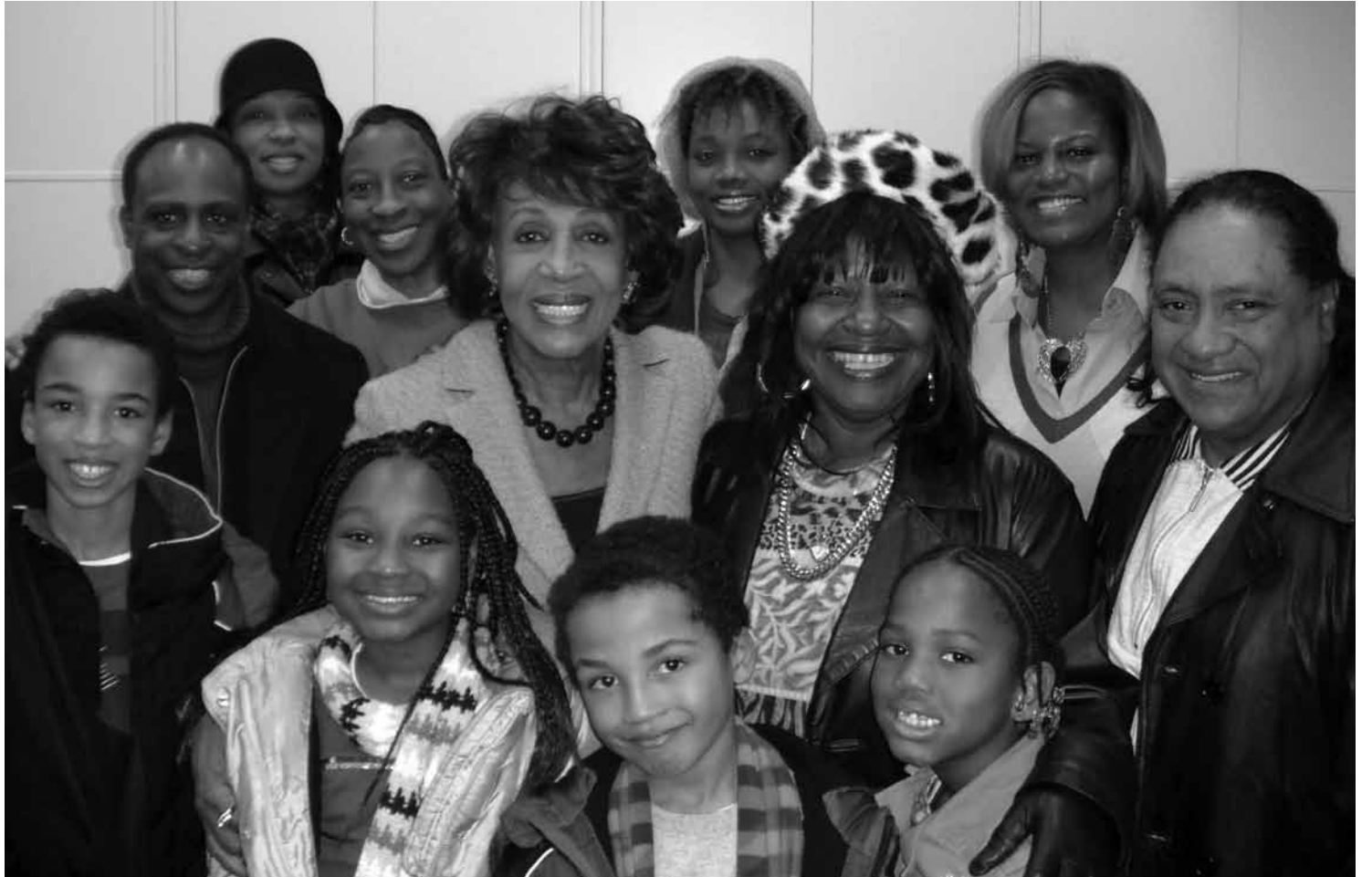
Congresswoman Maxine Waters (D-CA) welcomed constituents of the 43rd district in town for the Presidential inaugural ceremonies to her Washington, D.C. office during Inauguration weekend. "It was wonderful to meet with my constituents as they traveled to Washington to witness the second inauguration of President Barack Obama on Martin Luther King, Jr. Day," said Congresswoman Maxine Waters. "It was a historic moment for our country, and I'm honored my constituents had an opportunity to take part in it." Seen here Congresswoman Waters with students, parents and staff from Frederick KC Price III School.